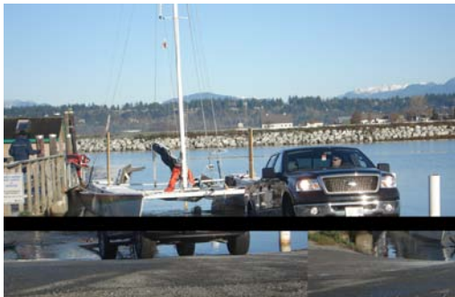
Bob's Boat Hauling Inc.