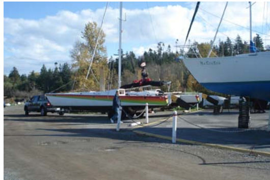
A tight squeeze