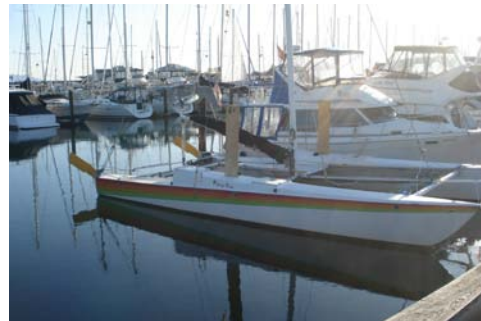
Back at the dock

Don't forget to check out the BCMS website for information on everything from boats for sale to dates for sailing events.