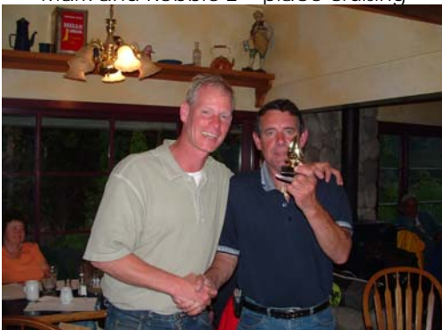
Super Cat 20 3 rd place racing