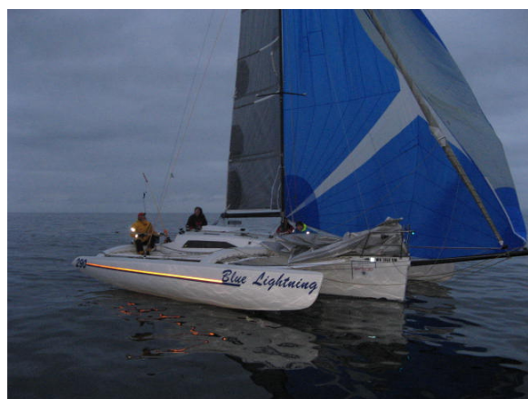
Blue Lightning after the turning mark