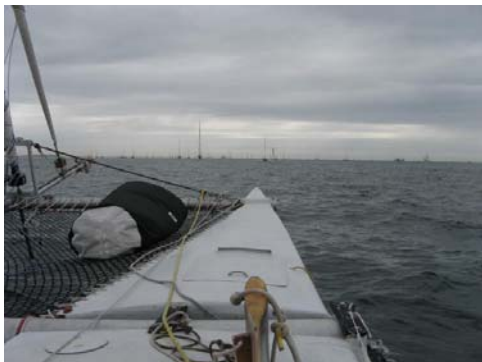
Bad Kitty heads to the start

wind. Bad Kitty got off to a good start near the committee boat end of the line