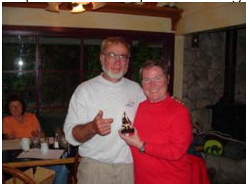
Flying Geese. 2 nd place racing