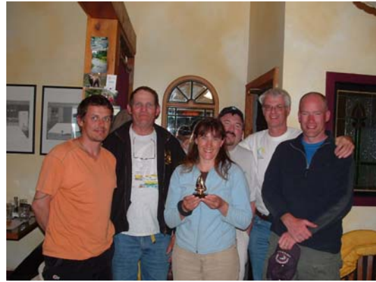
Bad Kitty and crew . 1 st place racing