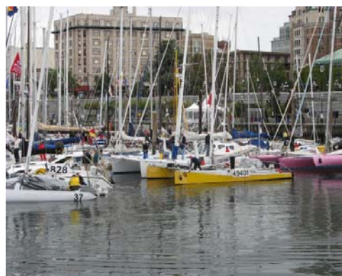
Bad Kitty on the dock in Victoria

Final race results will not be in until after all protests, safety violations and rescue time allowance claims have been evaluated.