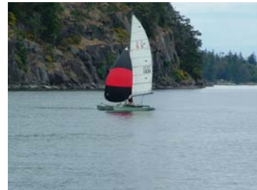
Gizmo determined never to give up!!!

Once again the BCMS had a fantastic three days over at Port Browning. Here are some of the pix and some of the highlights.