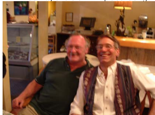
Friends for 50 years!!! Top that!!!!