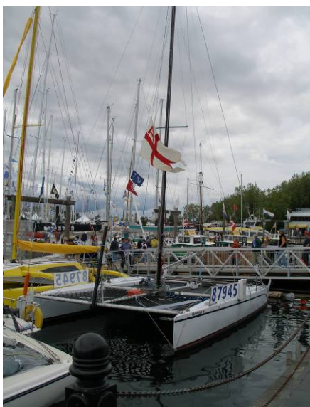
Cat Sass before the Race

By dawn we were close to the Canadian side about 10 miles west of Sheringham lighthouse with about 38 miles to go. We were able to set our Orange reaching chute and work our way up Juan de Fuca Strait on a gradually increasing West wind. We shifted up to 'big blue', our down wind symmetrical chute, and worked our way past Sooke Harbour at 7 – 10 knots of boat speed, gibing through about 60 degrees. Several big Swiftsure Lightship Boats passed us while we passed several slower monohulls. We could see about 10 boats ahead of us along the coast between Sooke and Race Rocks and it looked like one or two might be multihulls. It was obvious that we had lost a lot of ground to the monohulls