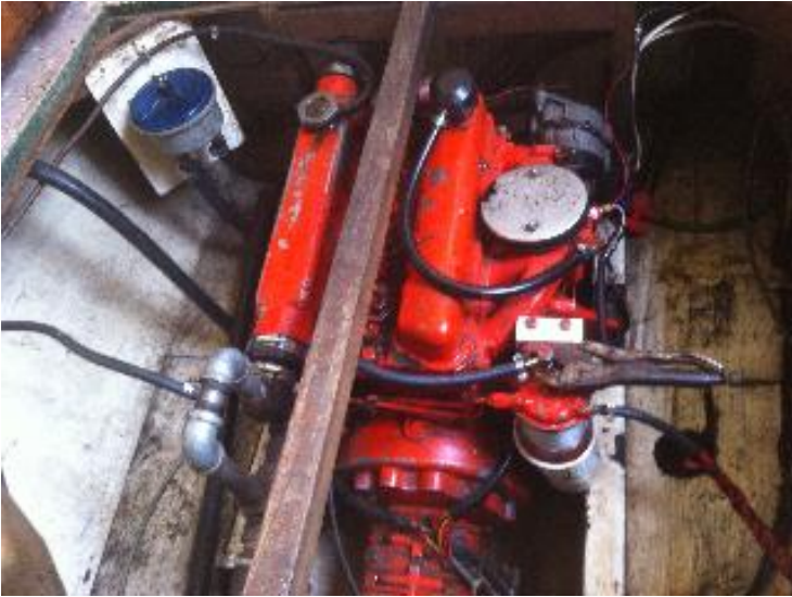
Old engine, seen better days...