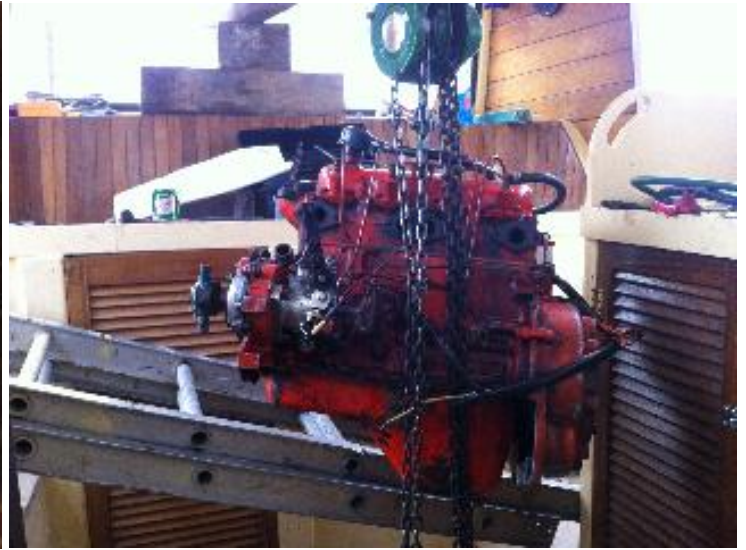
Using the cabin top to lift the engine out