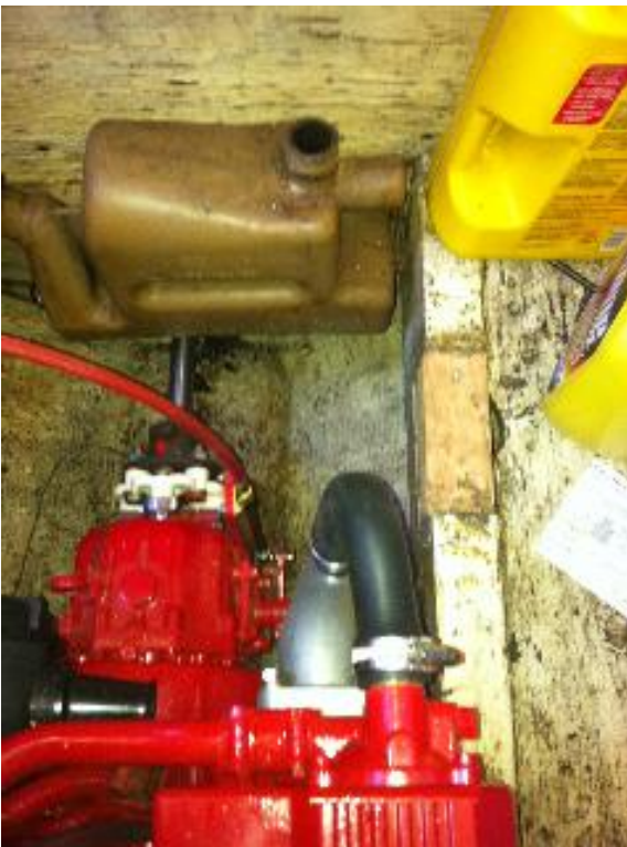
Shiny new engine, almost ready to go.