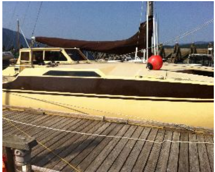
...After, looking good!