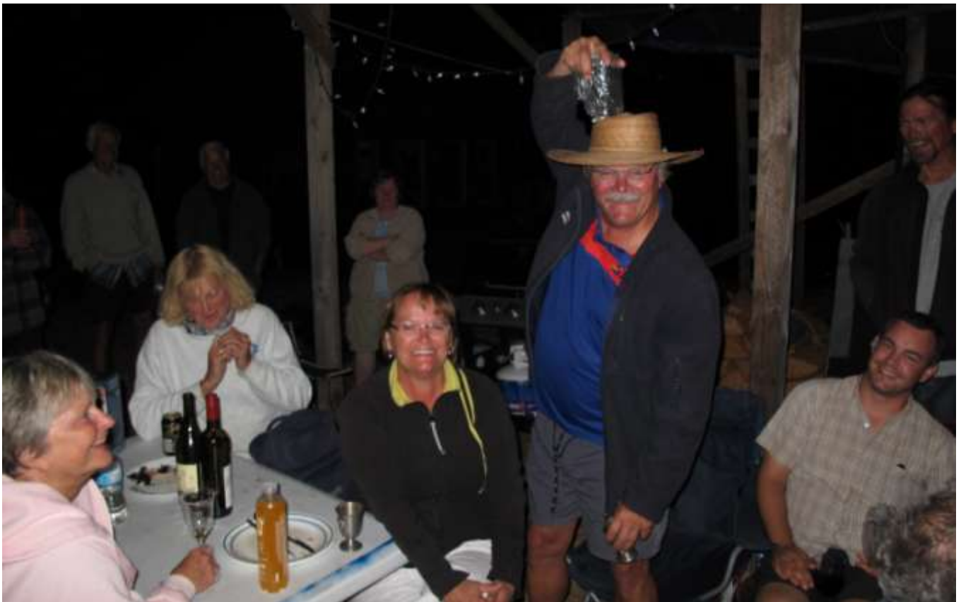
1 st place in the Cruising (in style) Division, Mustang Sally