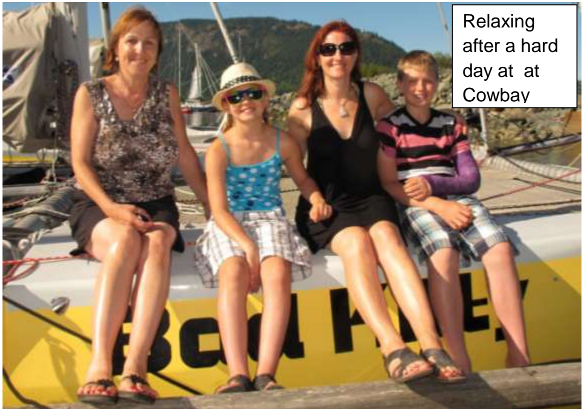
Relaxing after a hard day at at Cowbay