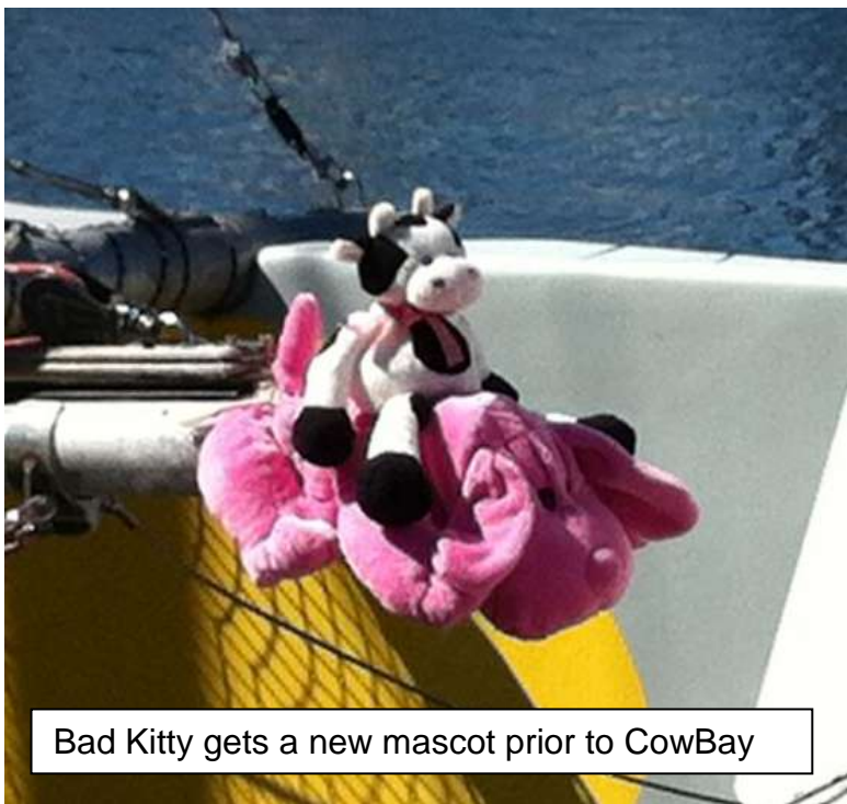
Bad Kitty gets a new mascot prior to CowBay