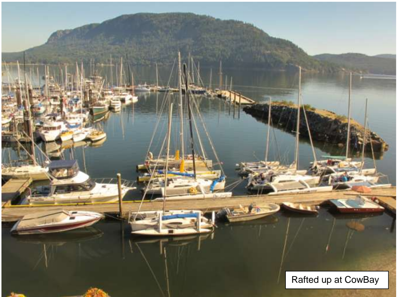
Rafted up at CowBay