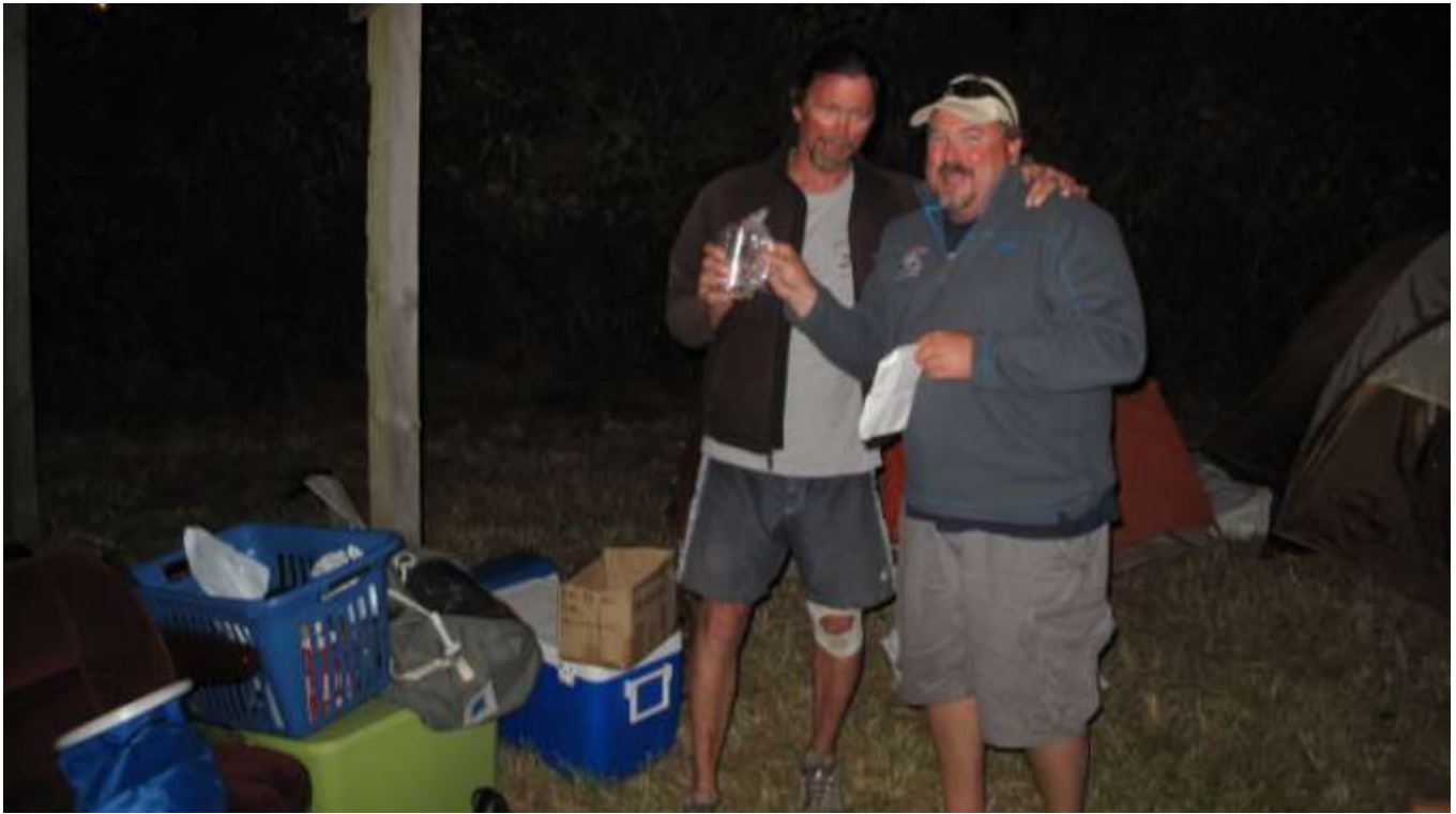
1 st place in the Racing Division, Dreamchaser