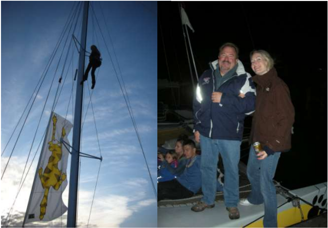
Canada Day at White Rock Pier, Bad Kitty and Flying Kiwi enjoyed the fireworks and entertainment at the pier.