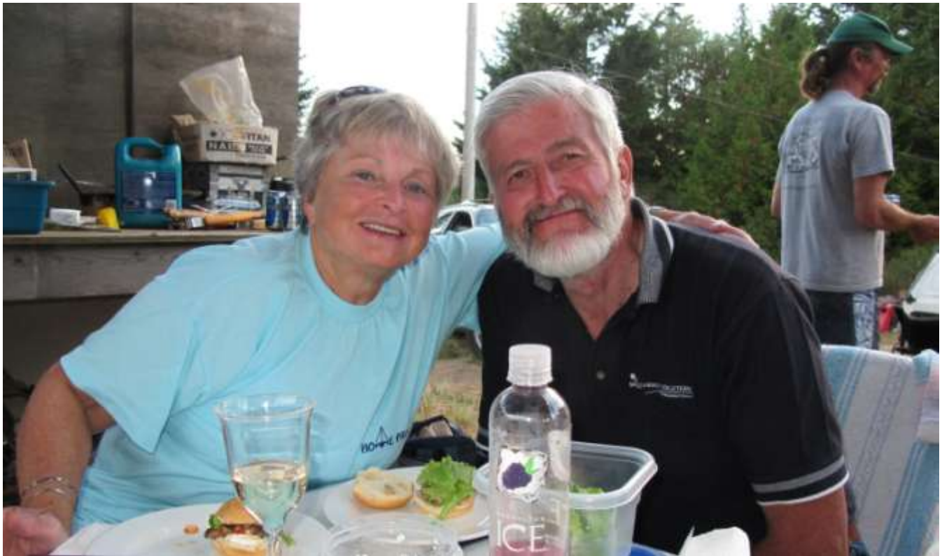
Saturna Sail-in September Long Weekend