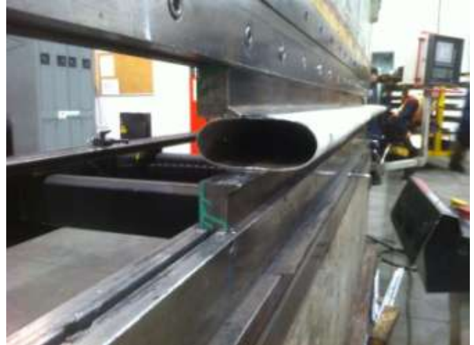
Press the mast section to make it taller and narrower