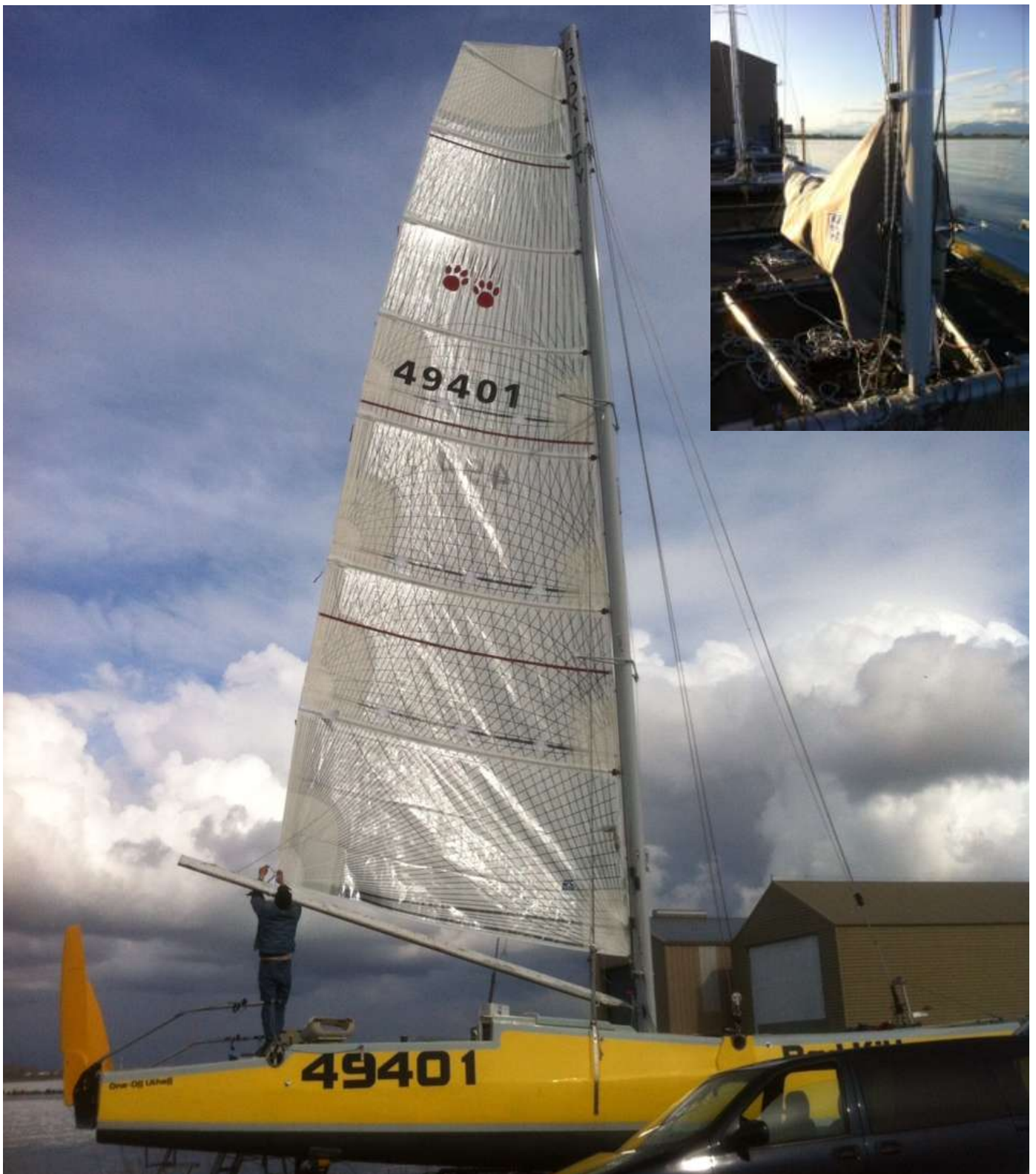
And a new Main Sail, and sail cover.