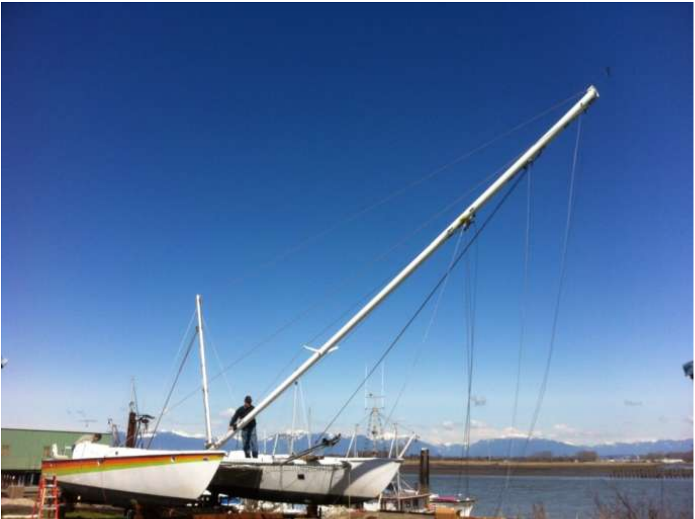
Ron's an expert at mast raising, Bob's new mast step works great!