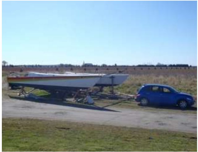
Updated mast fittings, added reacher connection points, new mast step.