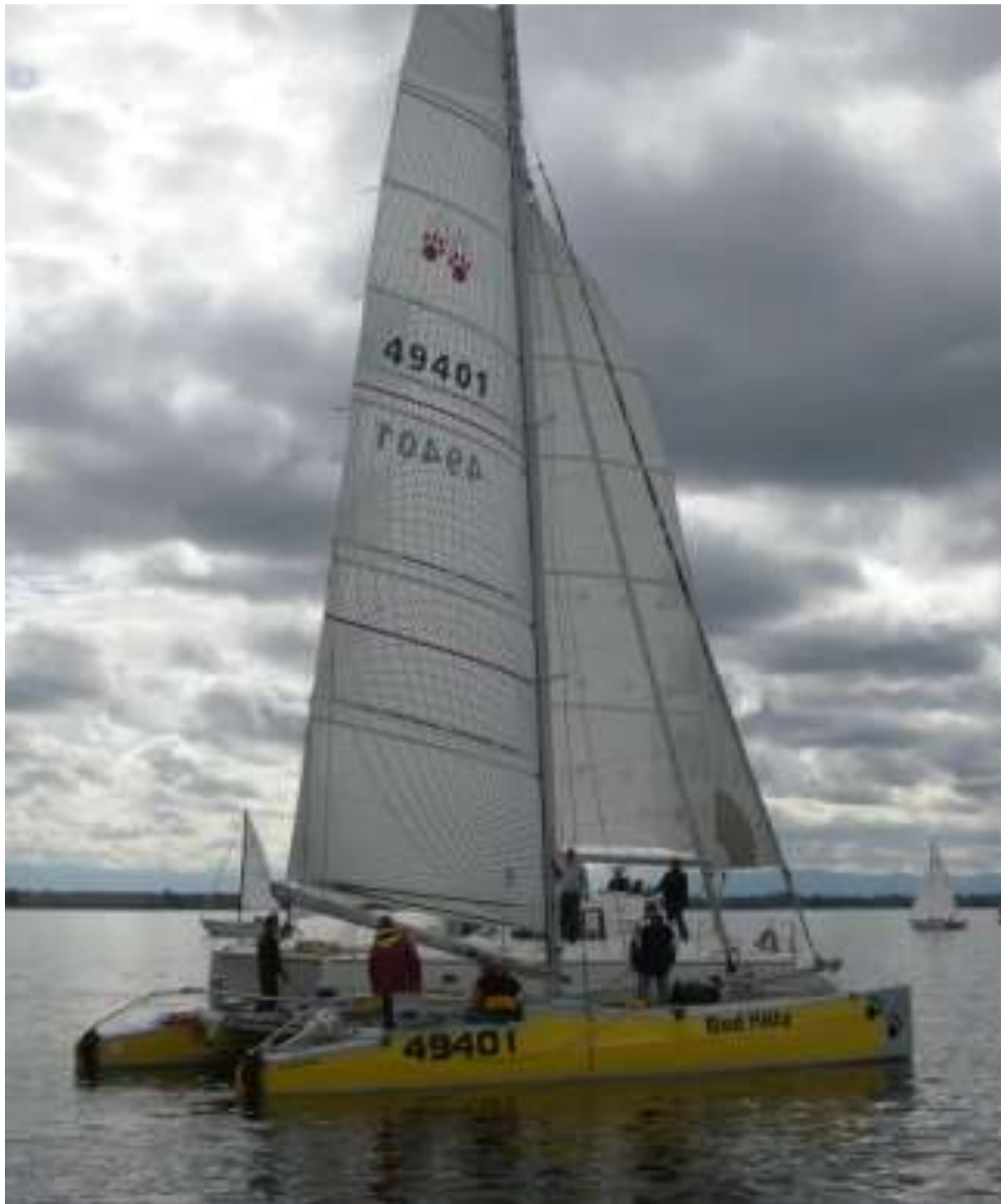
Congratulations, Bad Kitty gets second place in the 2012 Semiahmoo Regatta