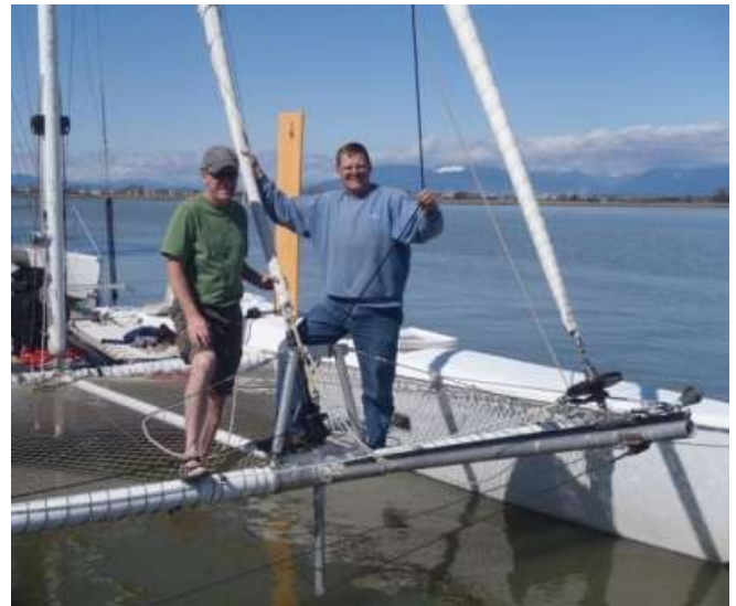
New bowsprit, jib furler, reacher furler