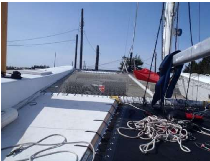
New (old) longer and stronger boom