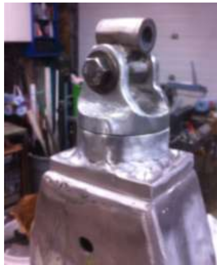
Machine a new gooseneck