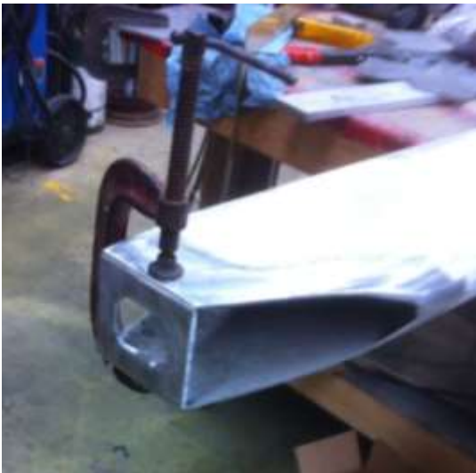
Narrow the boom for the gooseneck