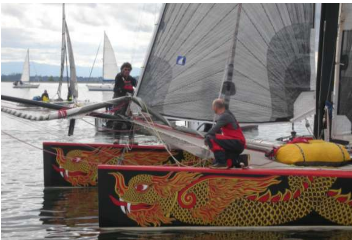
Dragonfly at Semiahmoo Regatta