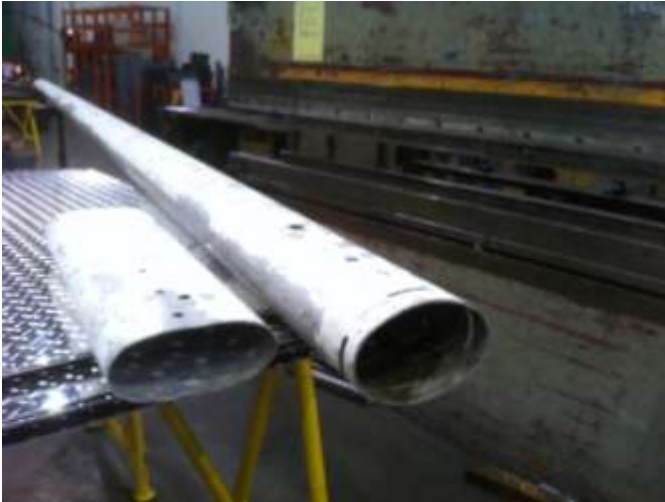
Salvaged mast section