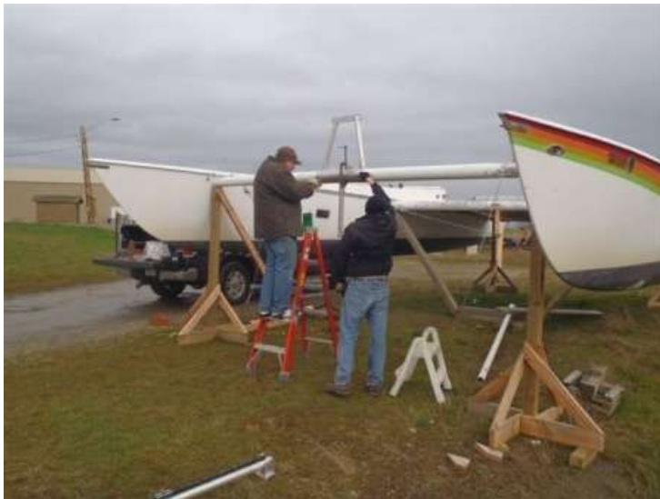
Installing the new Seagull striker, Dolphin Striker