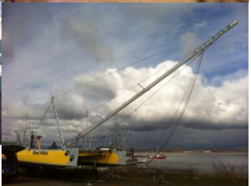
Freshly painted mast and all the fittings!