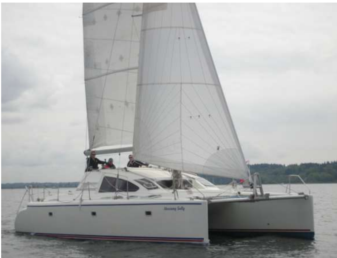
Mustang Sally at Semiahmoo Regatta