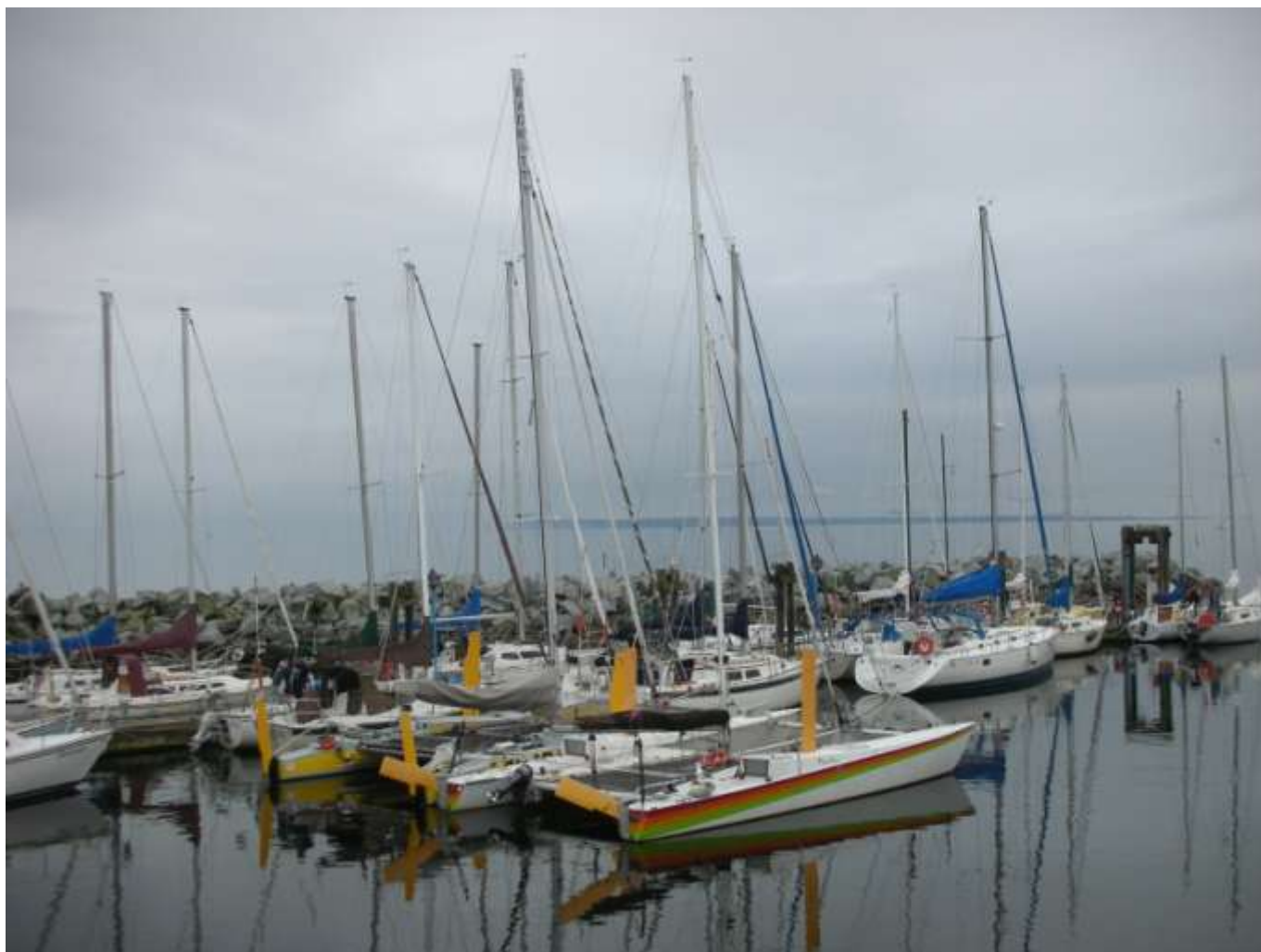
Bad Kitty and Flying Kiwi at White Rock Pier for Semiahmoo Regatta