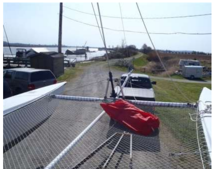
New forward netting (no more wet feet!)