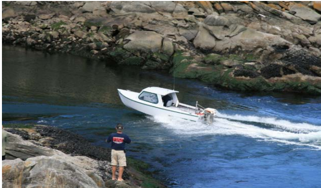
The ‘Minnow’ in better days